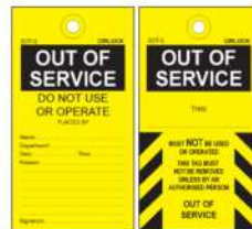
Out of Service