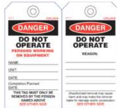
Do Not Operate