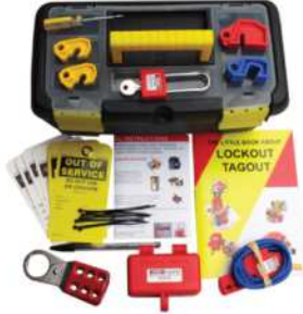
Code: CLK-5 (toolbox)