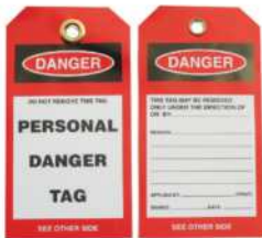
Personal Danger Tag