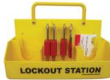
PORTABLE - LST-6 AND LST-7