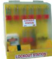
LST WITH LID