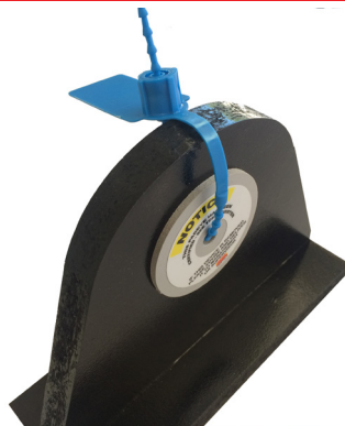
PEL-1 suitable for hole size up 30mm (1") Disc diameter 60mm