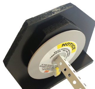
PEL-2 suitable for hole sizes up to 20-120mm (4") Disc diameter 120mm and 160mm