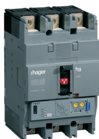
Suitable for Hager H250 breakers and similar