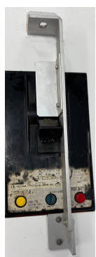
SALD-B-2 for illustration purposes only